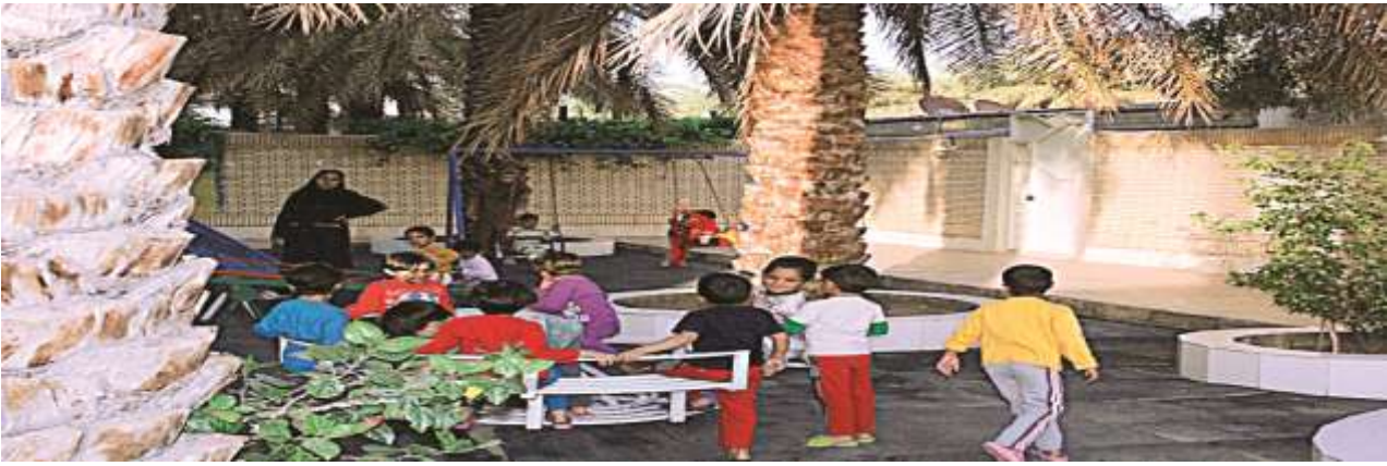
▲ Sepehr Children Center No. 1 in Bam

We thank the Lord God that the adopted approaches have been successful and that four years on since the first sheltering of Sepehr Children, there are today significant changes for the better in their mood and attitude, education, religious and social aspects of life evident.