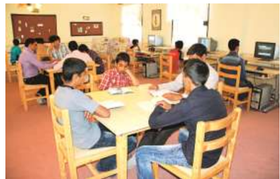
▲ Sepehr Children Center No. 3 in Bam