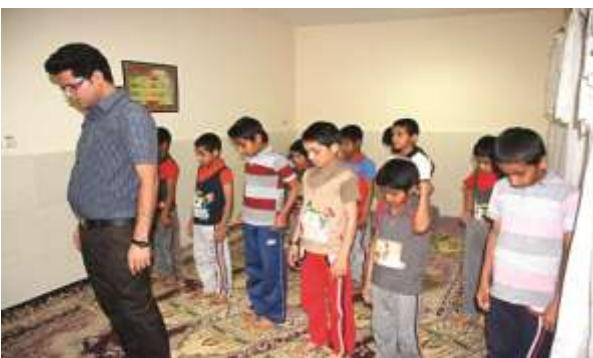
▲ Sepehr Children Center No. 4 in Bam