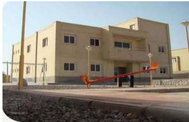
▲ Center for training, rehabilitation, and vocational training of mentally handicapped children and adolescents