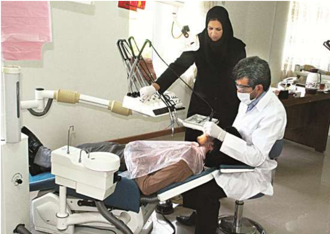
▲Sepehr Complex Clinic – Dentistry Unit