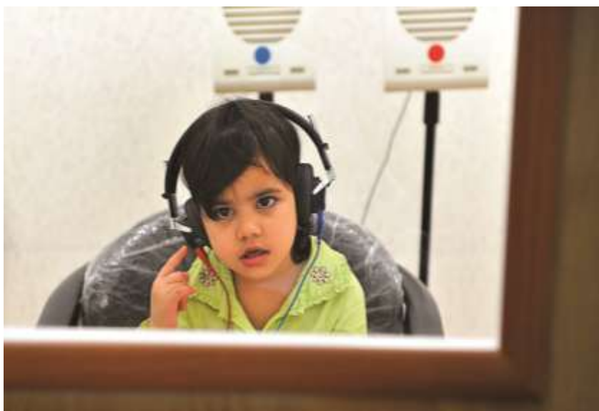
▲Center for training and rehabilitation of deaf children and their family and children with impaired hearing – Audiometry

The hard work of the experts and the instructors of this Center has made it possible for 18 of the sheltered children by Sepehr Charity Foundation to begin education in the academic year of 2010/11 in normal schools.