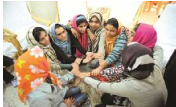
▲ Sepehr Children Center No. 2 in Bam