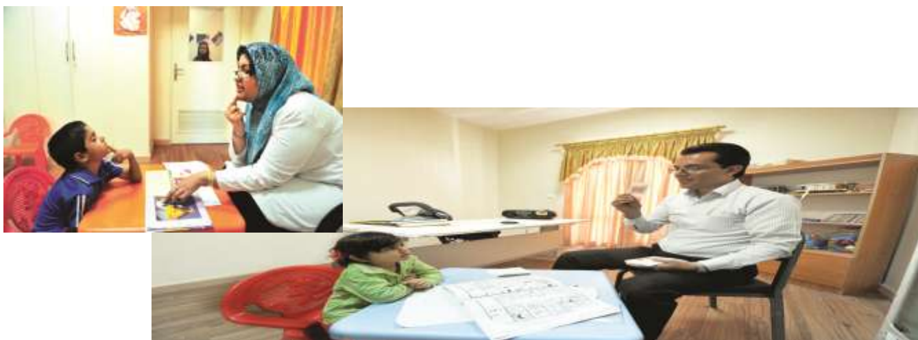
▲Center for training and rehabilitation of deaf children and their family and children with impaired hearing – Speech

Currently 18 children together with their mothers, that is a total of 36 individuals, are benefiting from the education and rehabilitation services provided by and at this Center. Commuting services, midday meals and warm lunches are some of the services offered by this Center.