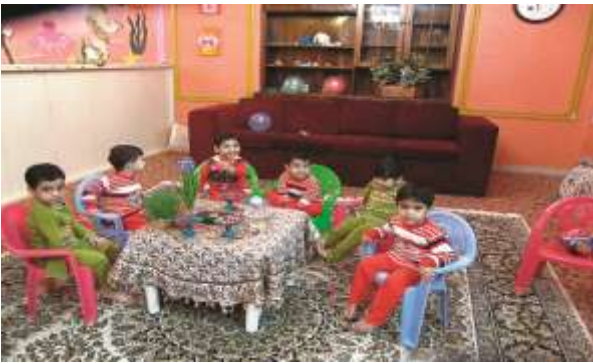
▲ Sepehr Children Center in Babol

18 of Sepehr Children completed their secondary school in 1389/2010-2015 and ten of them admitted at university after having passed the entrance exam. 17 of Sepehr Children got married having received the support of the Organization. It is the prime interest of Sepehr Charity Foundation to continue supporting all of Sepehr Children to complete their university degree, to find a respectable employment, to get married and start a family.