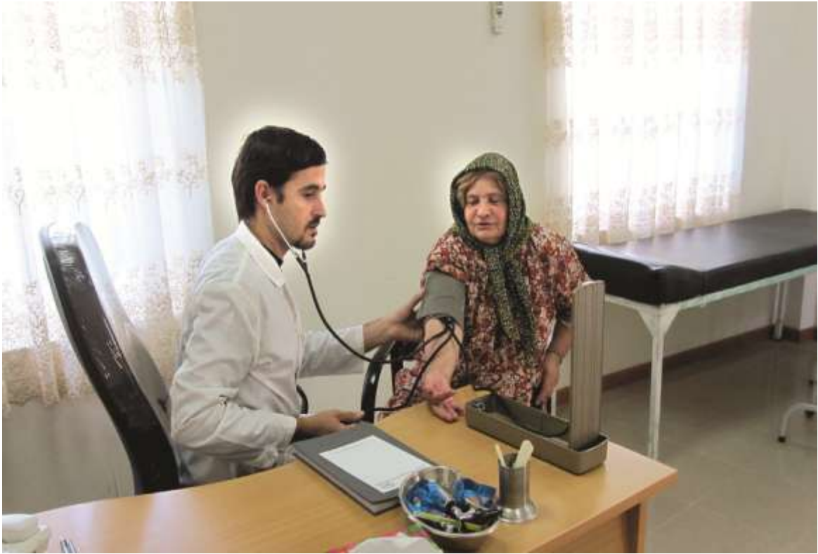
▲Sepehr Complex Clinic – Medical Unit